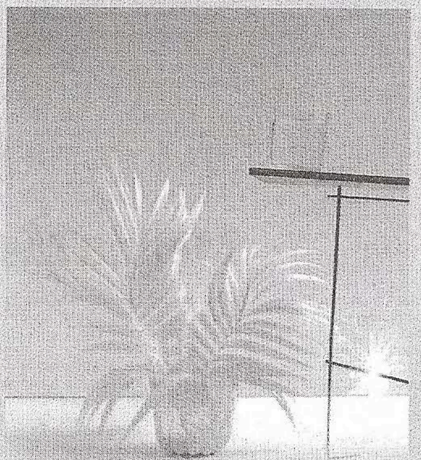
Alwin Lay, Mod. CLASSIC (2010/2013)

The statement continues: "Nothing is what it seems. But still it is just the way it is. This generation of young photographers brings up painful