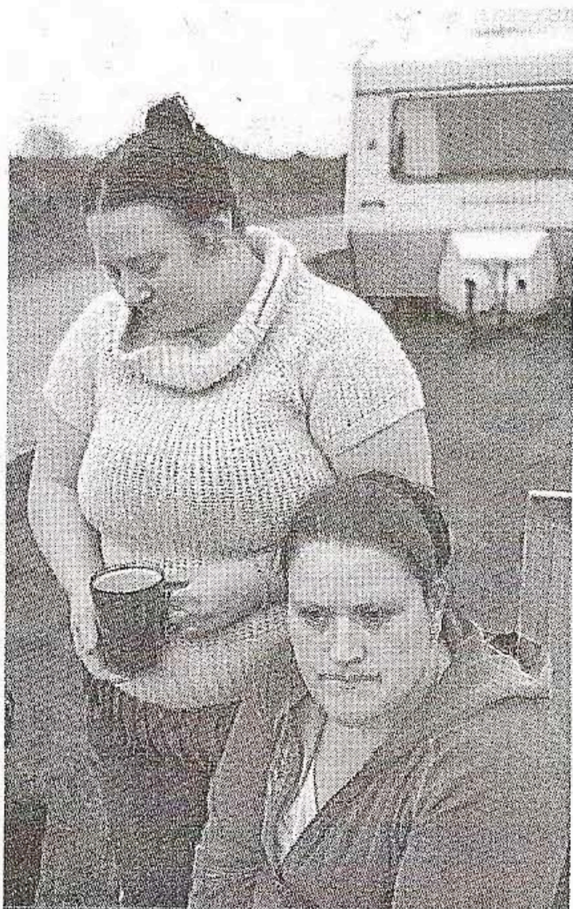
Birte Kaufmann, The Travellers (2012)

The basis of Nadja Bournonville's work is the cluster of symptoms that used to be known as hysteria, a disorder caused by a wandering (sexually unsatisfied) uterus. Freud saw it as a conversion disorder, a transfer of a mental affliction to the somatic level. In her photographic work, "A Conversion Act", Nadja Bournonville addresses this idea of conversion from the mental to the physical, creating two series of eight images each that complement one another.