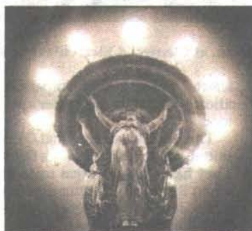
COLIN WINTERBOTTOM/HILL CENTER